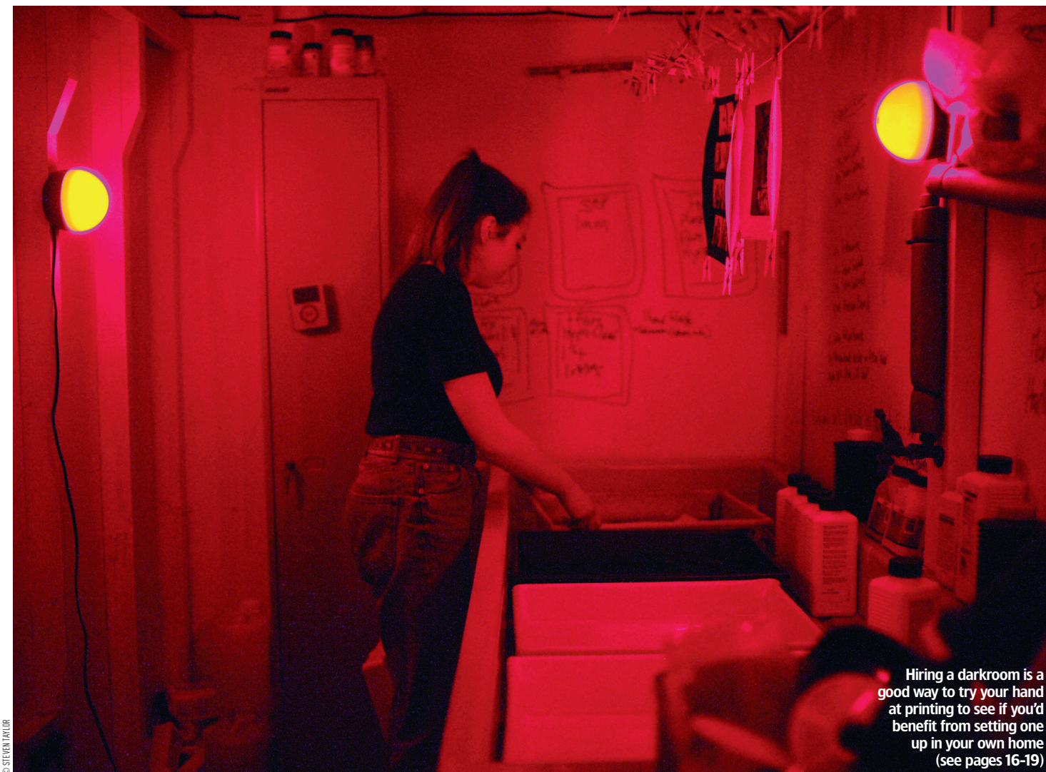
Hiring a darkroom is a good way to try your hand at printing to see if you'd benefit from setting one up in your own home (see pages 16-19)

This darkroom was set up by a group of Leicester-based photographers, all of whom